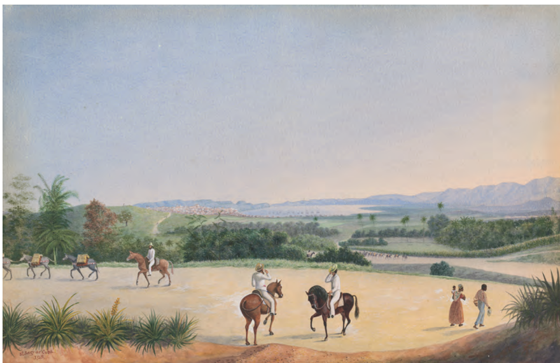
Fig. 4 James Gay Sawkins, St. Jago de Cuba , c. 1859, watercolor, National Library of Australia, Rex Nan Kivell Collection

artists were mostly local amateurs. 40 This record of an artistic milieu on St. Thomas also evinces how the newspaper functioned as the central public organ for defining the parameters of aesthetic taste emblemized by artists like Sawkins.