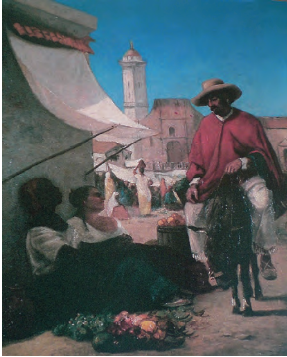
Fig. 8 Camille Pissarro, Plaza Mayor de Caracas , 1862, oil on canvas, La Casona Presidential Palace

cloth belt, a poncho, and a wide-brimmed hat—the traditional costume of a llanero, a herder and skilled horseman from the Llanos grasslands and symbol of Venezuelan national identity. The first photo presents him striking a sinuous contrapposto pose as he leans against a goad wound in rope while holding a cigar in his raised left hand. In the second, Pissarro props himself up on his right elbow as he reclines on a blanket; he holds a lasso in his right hand and gazes out of the frame, his face in profile.