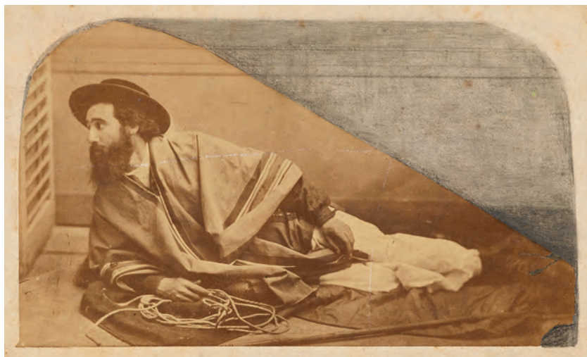
Fig. 7 Artist unknown, Camille Pissarro in Llanero Costume , c. 1855, calotype photograph, Ashmolean Museum