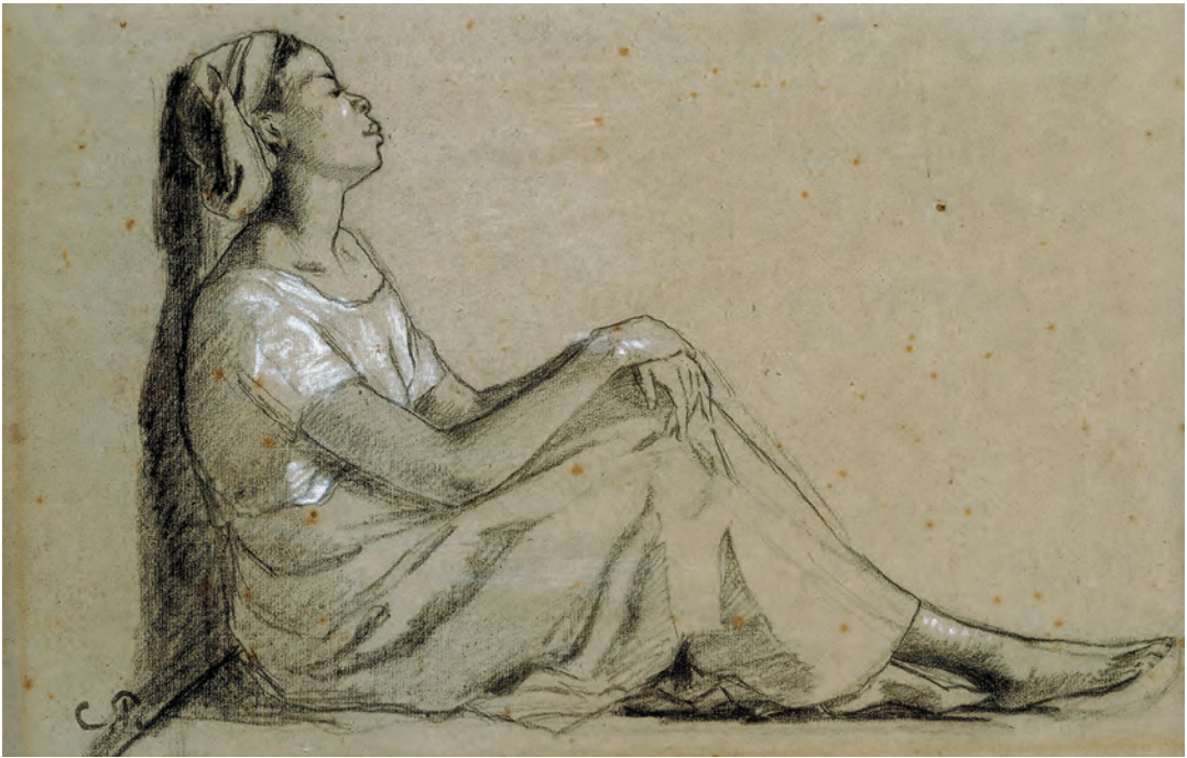
Fig. 9 Camille Pissarro, Young Seated Negress , c. 1855–1857, charcoal and white chalk on paper, private collection