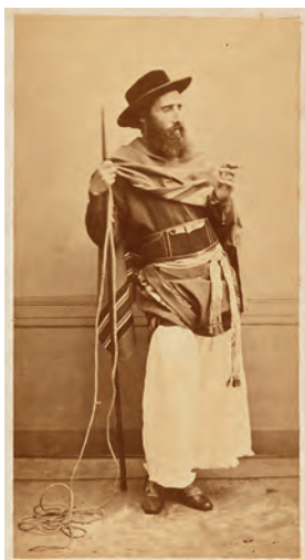
Fig. 6 Artist unknown, Camille Pissarro in Llanero Costume , c. 1855, calotype photograph, Ashmolean Museum