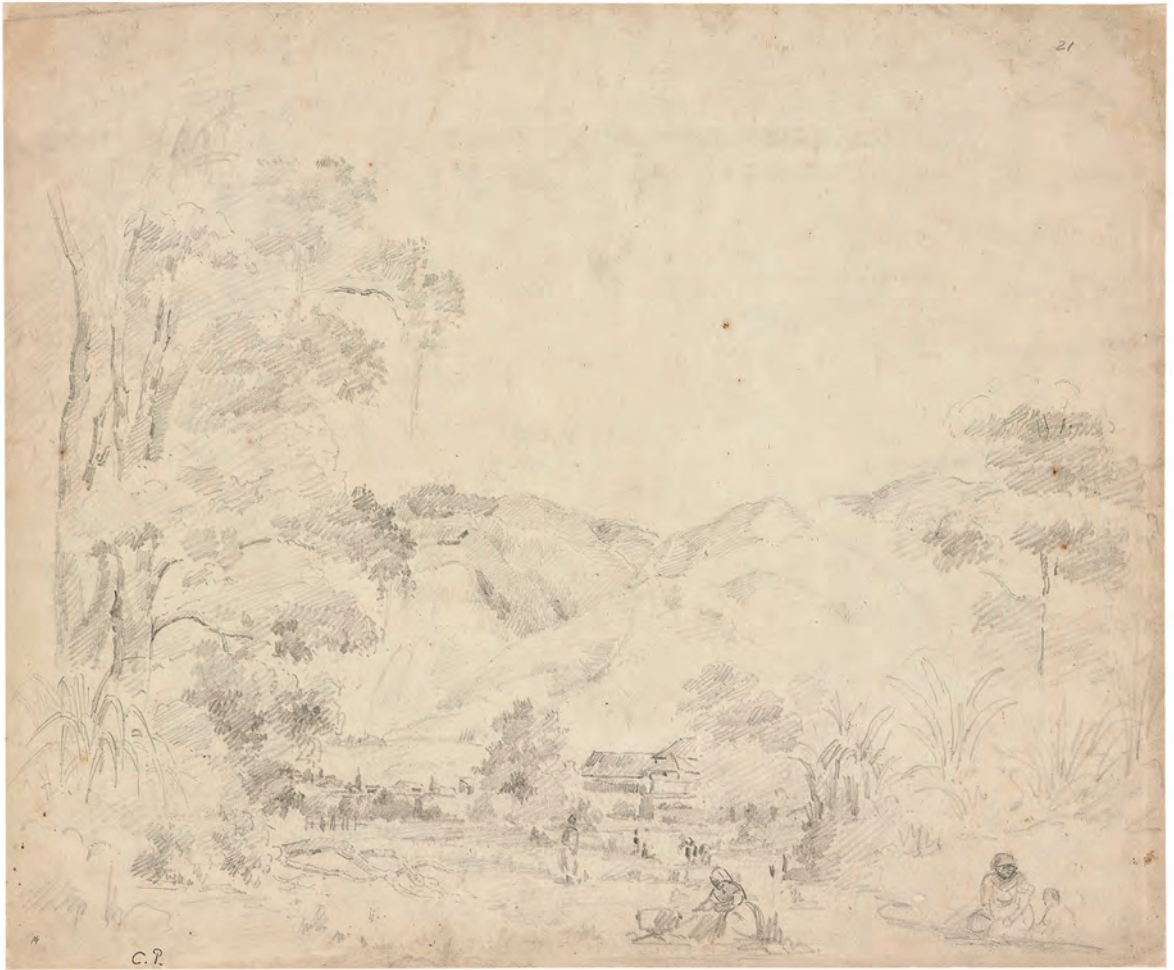
Fig. 5 Camille Pissarro, Landscape with Female Figures Washing , c. 1853-1854, pencil on paper, Ashmolean Museum