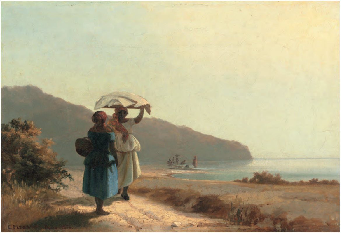
Fig. 1 Camille Pissarro, Two Women Chatting by the Sea, St. Thomas , 1856, oil on canvas, National Gallery of Art, Washington, Collection of Mr. and Mrs. Paul Mellon

of a post-emancipation modernism emerge if one traces the incongruities between the revolutionary leadership of Black women in the Danish West Indies during this period, and the history of representing laboring freedwomen as a symbol of erotic fantasy in the colony.